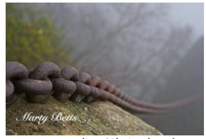
Intermediate/Chained Rock First Place - Marty Betts